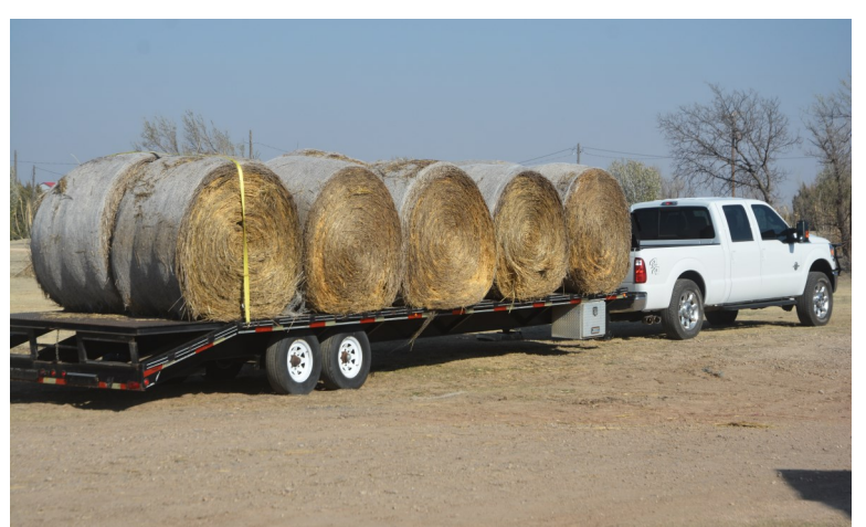
Producer hauls donated hay to feed his animals