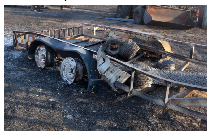
Damages sustained to trailers and equipment